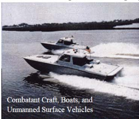
Combatant Craft, Boats, and Unmanned Surface Vehicles

The Naval Surface Warfare Center Carderock Division (NSWCCD) will be on campus October 31, 2011 for an information session at 337 Towne from 6:00 – 7:00pm. This information session will give you a more detailed description of our organization and what we are doing in the management of ships and ships systems. It will also explain how you as an engineer working for us will play into the important mission of the organization.