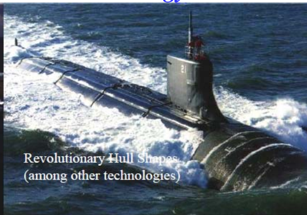
Revolutionary Hull Shapes (among other technologies)

"Our mission is to provide research, development, test and evaluation, fleet support, and in-service engineering for surface and undersea vehicle hull, mechanical, and electrical (HM&E) systems, propulsors, logistics research and development, and to support to the Maritime Administration and maritime industry and the United States Navy"