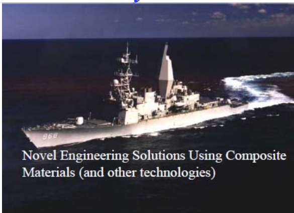
Novel Engineering Solutions Using Composite Materials (and other technologies)

The Navy's National Maritime Technology Center